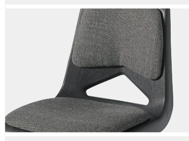
Optional Seat and Back Pad