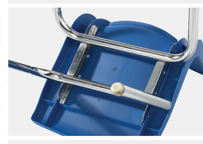
Secure Frame Attachment