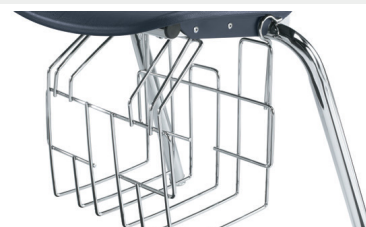
Field Installed Wire Book Basket