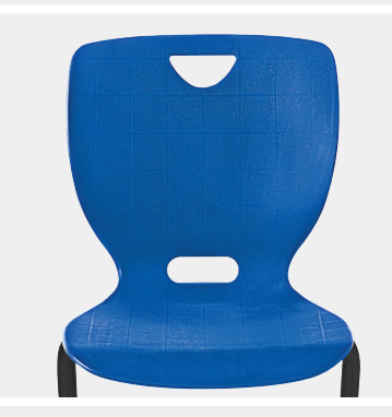
Two Convenient Handle Openings Increase Airflow and Make Rearranging Seating Easier