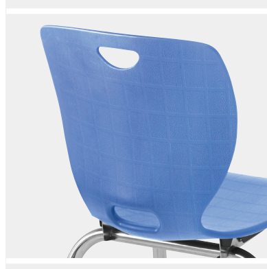
Sleek, Smooth-Back Shell Design Offers Easy Maintenance