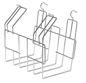
Field Installed Wire Book Basket